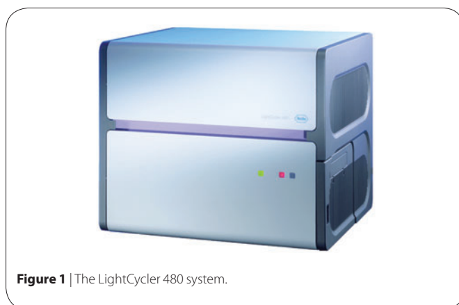
Figure 1 | The LightCycler 480 system.

For either method, melting-curve raw data are generally represented by plotting fluorescence over temperature, with the relevant temperature