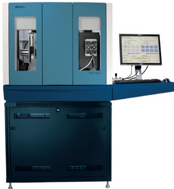
The SOLiD system from Applied Biosystems is an example of next-generation sequencing technology.

era of personal genomics (for additional discussion of technology behind personal genomics see the Technology Feature on personal genomics in the October 4, 2007 issue of Nature ). Church notes that this 1% of the genome might yield 98% of the information regarding positions that cause changes in traits.