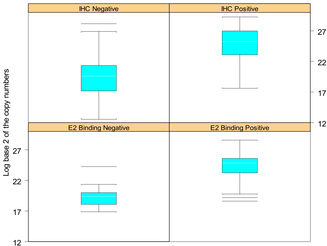
Figure 1 A Box plot drawn for the ER \alpha mRNA copy numbers (logarithm base 2 scale) in the four groups (positive and negative by IHC and by estrogen binding assay) using S-PLUS software is shown.

to lack of ER \alpha gene expression or methylation of its promoter, but may be due to post-transcriptional or post-translational mechanisms. Alkarain et al [19] reported the presence of ER \alpha mRNA in immunohistochemically ER \alpha -negative tissues. However, none of the above studies has evaluated the threshold levels of ER \alpha mRNA levels in immunohistochemically negative tissues or those negative by ligand binding assays. Our quantitative analysis of ER \alpha mRNA copy numbers demonstrate that breast cancer tissues that are negative by both IHC and ligand binding express significant levels of ER \alpha mRNA. The reasons why the mRNA is not translated to detectable protein are not clear. Our previous studies on ER \beta mRNA copy numbers [9] in breast cancer tissues have shown that at the 5 \times 10^6 copies per 10^{10} mRNA copies of GAPDH levels ER \beta protein is translated. It is possible that either ER \alpha mRNA is not translated or the translated protein is degraded to undetectable levels in these tissues.